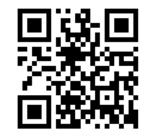
Scan for online version

Table 1. Characteristics of participants of the EMPA-REG trial compared with those using SGLT2s in the real world. *Only people with similar cardiovascular risk factors to those in the EMPA-REG trial are included.